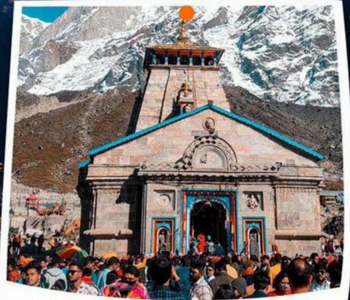
Shri Kedarnath Dham